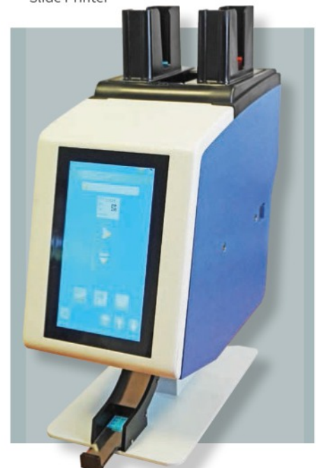
▼ PiSmart Twin Hopper Slide Printer