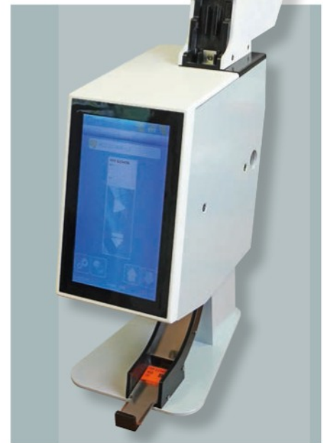
▲ PiSmart Slide Printer with optional delivery system